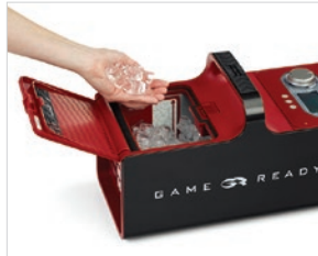
FILL ICE AND WATER

The Game Ready System is easy to set up, with an intuitive interface and fingertip controls for treatment customization. An optional battery pack enables treatment on the go.