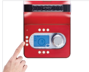
SELECT PROGRAM (OPTIONAL)